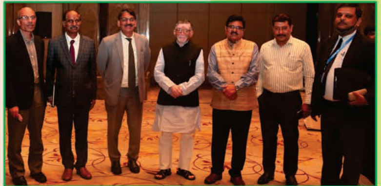
Committee on Public Undertakings (COPU) Visits Bangalore