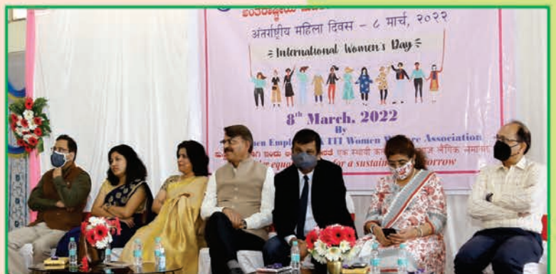
International Women's Day Celebrations at ITI Limited