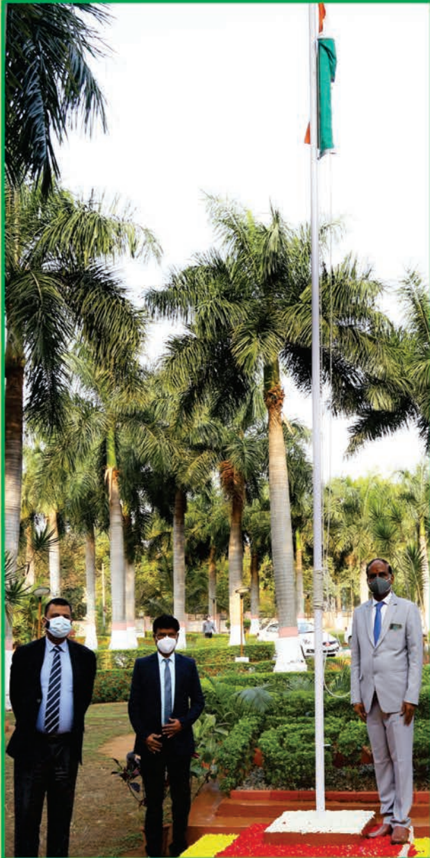
73 rd Republic Day Celebrations at ITI Limited